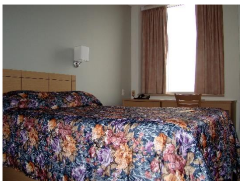
90U Suite Style Guestroom

Suite-style: Air-conditioned suite-style units include two separate bedrooms with a double bed in each room, a washroom with shower, kitchenette equipped with fridge and microwave, table and chairs. Please note kitchenware such as utensils and dishes are not provided. $110.00 per suite plus applicable taxes