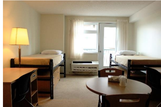
Friel Double Suite Style Room

Suite-style: Air-conditioned suite-style units include a bedroom with two single beds, a washroom with shower, kitchenette equipped with a mini-fridge and microwave, table and chairs. Please note kitchenware such as utensils and dishes are not provided. $45.00 per person plus applicable taxes.