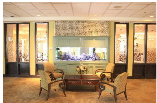
Friel Residence Lobby

Approximately a 10 minute walk to the main campus, this residence is adjacent to a public library, cinema, grocery store (24/7), the By Ward Market, a pharmacy, the uO Health Clinic and in close proximity to bus routes.