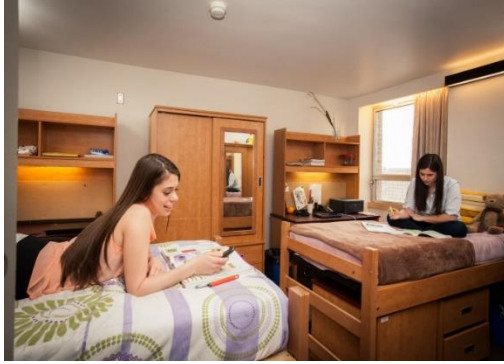
Traditional Residence Double Room

Traditional Residence: In the traditional residences, our single and double rooms are furnished with one or two single beds, a desk and chair, and an armoire for each guest. These residences have separate men's and women's washrooms on each floor and are not air-conditioned. $30.00 per person plus applicable taxes