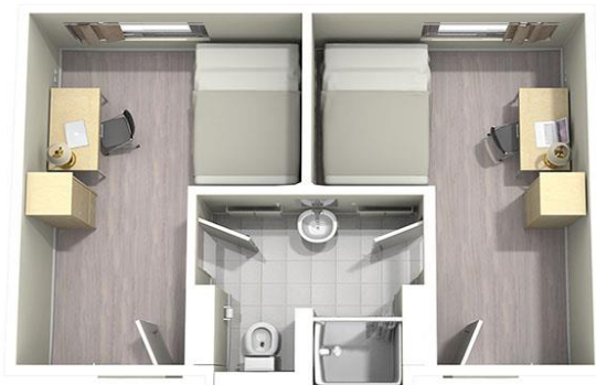
Henderson Residence Suite

Traditional Residence: In the traditional residences, our single and double rooms are furnished with one or two single beds, a desk and chair, and an armoire for each guest. These residences have separate men's and women's washrooms on each floor and are not air-conditioned. $30.00 per person plus applicable taxes